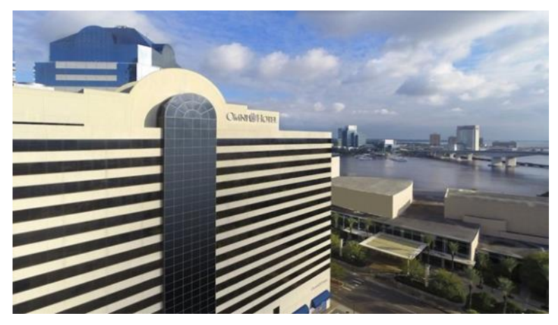
The Omni Jacksonville Hotel and Resort, 245 Water Street in Jacksonville, is just steps from the St. John's Riverwalk.

Also during the state convention there will be a report on the status of AFA Florida. This report will include an update on pending chapter closures. Each chapter represented at the state convention will have an opportunity to report on its activities.